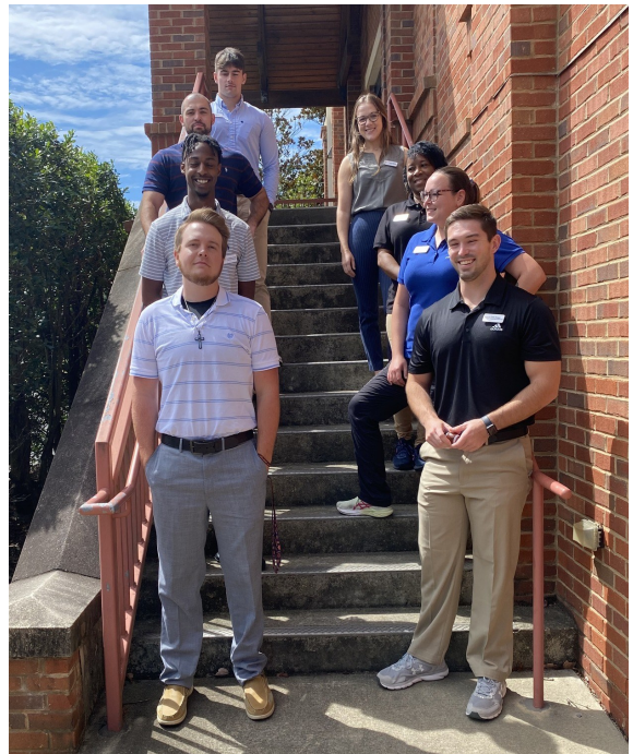
Calhoun Community College (Below)