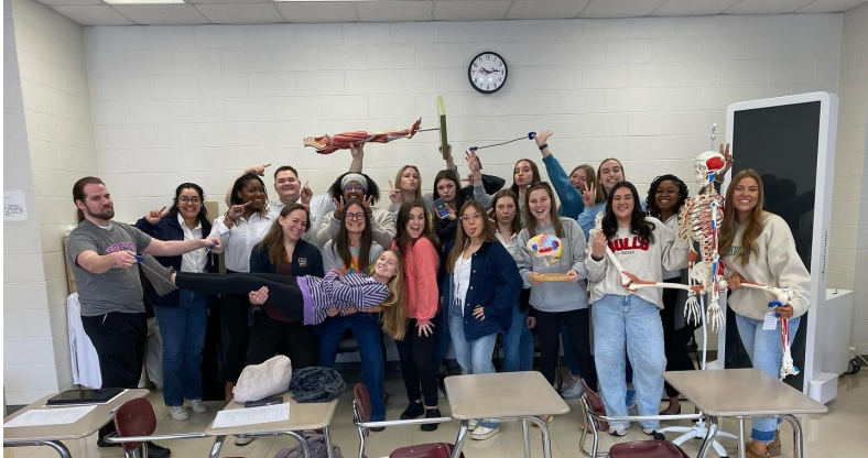
Jefferson State Community College (left)