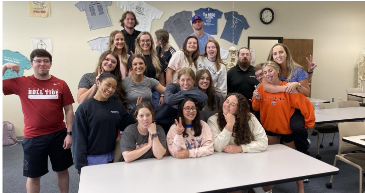
Wallace State Community College - Hanceville (left)