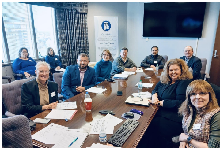
First Board meeting of 2025!