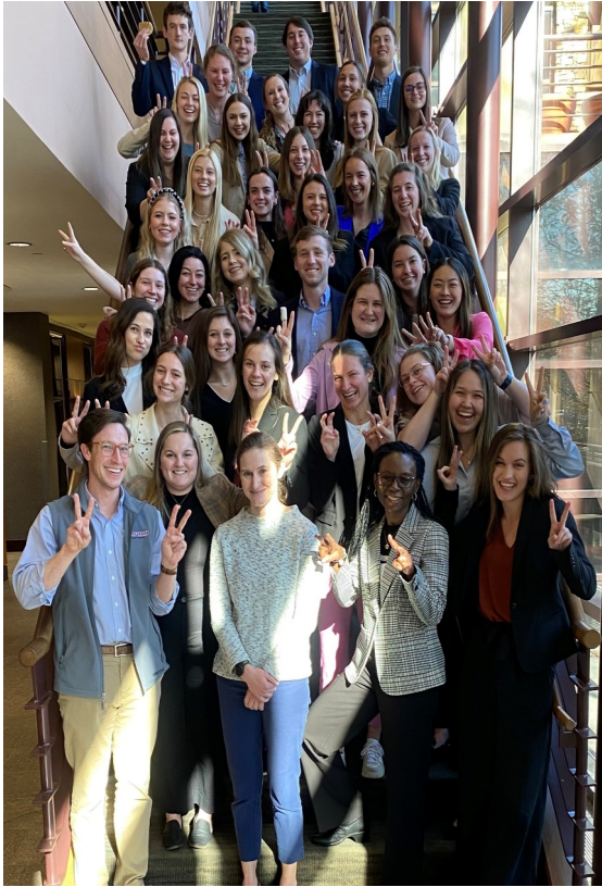
2nd Year DPT Students - Samford University - Above