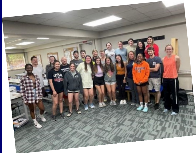
Southern Union PTA Students—Left Wallace Hanceville PTA Students—Below