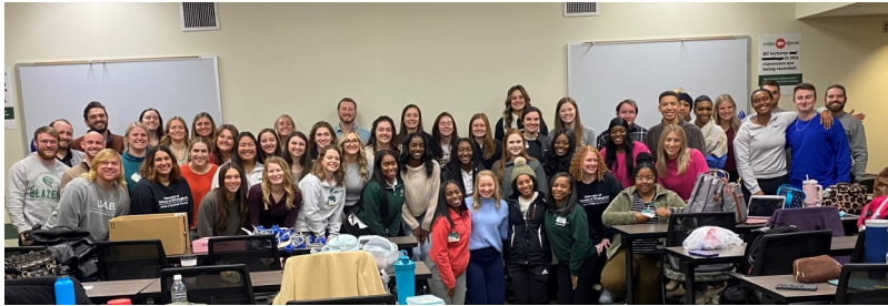
3rd Year UAB DPT Students—Left and Below