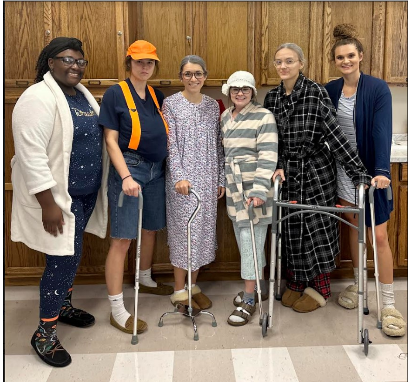
LBW Community College PTA Students in the Halloween spirit! - Above