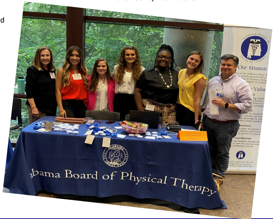
APTA Annual Conference—Right