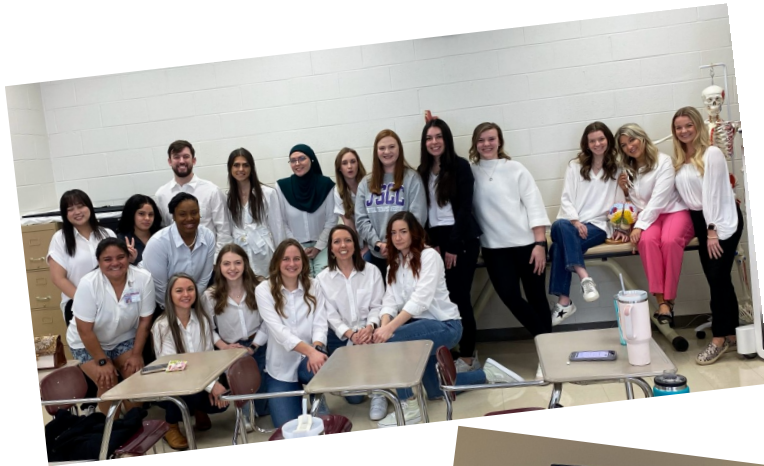
Jefferson State Community College (left)