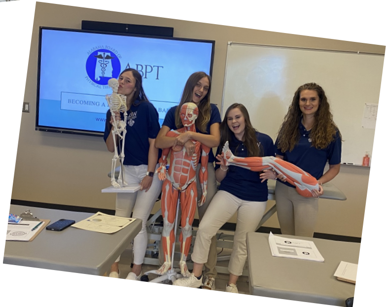
South University in Montgomery (left)