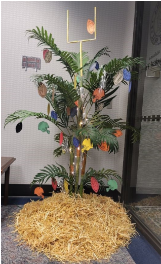
Football themed tree as suggested by one of our Facebook followers.