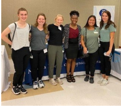
APTA Conference at Jefferson State Community College