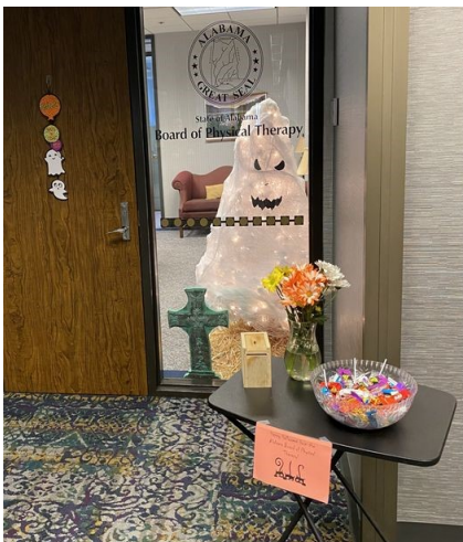
Don't be afraid! He's a friendly ghost!