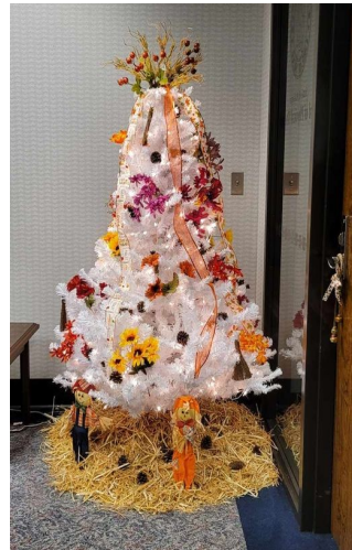
Happy Harvest/ Thanksgiving!

This year we were introduced to Pistachio the Cat (left) who gave tips during the renewal season and helped motivate our licensees to renew early!