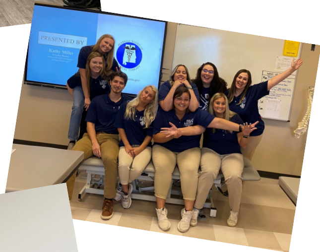
South University in Montgomery