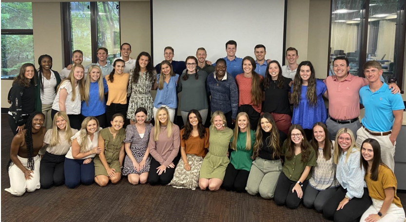
Samford University's 2024 DPT Class