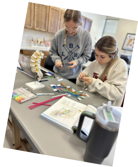
Top and left—LBWCC students hard at work building and diagraming brachial plexus.

Want to see your school featured in future newsletters? Please email them to info@pt.alabama.gov .